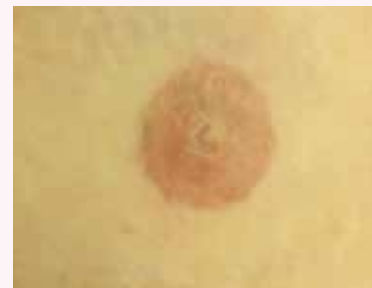
Close-up of an actual 3D nipple tattoo