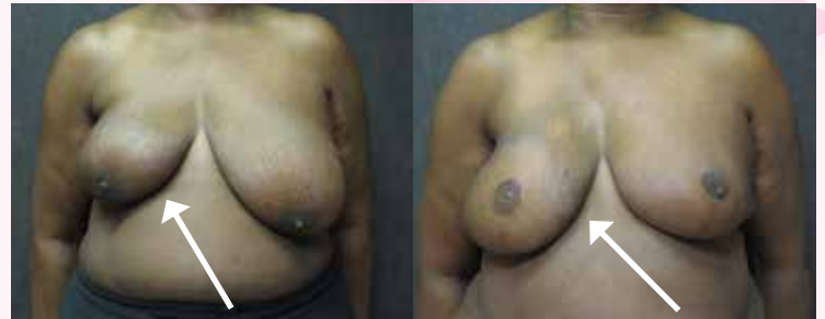
Cancerous Breast Pre-Op

DIEP flap procedures preserve all the abdominal muscles. Only abdominal skin and fat are removed similar to a tummy tuck.