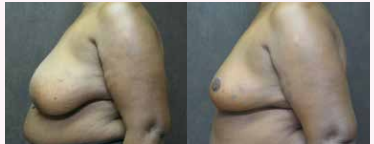
Non-Cancerous Breast Reduced for Symmetry

Although the operation is a little longer and more complex than some other procedures, patients experience less pain after surgery and better preservation of the inframmary fold. This leads to a faster recovery and maintains their abdominal strength long-term.